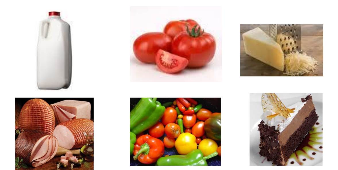
Ready to eat foods and pre-cooked meats