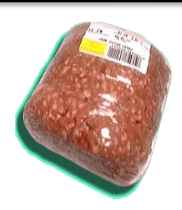
Raw ground beef & raw shell eggs - Cook to 155 °F