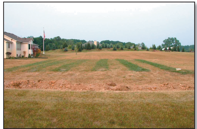
Figure 1. Brown turfgrass over soil absorption field trenches indicates an absorption field that is probably functioning as designed.