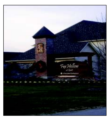
Left: Subdivision Entry Signs