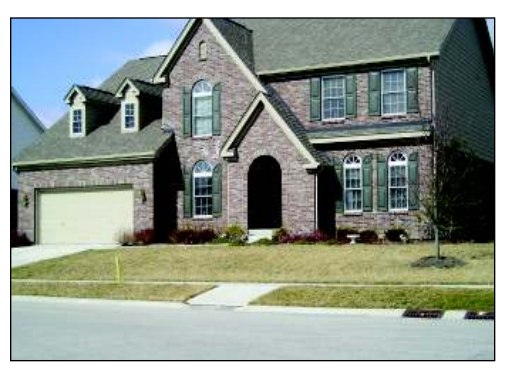
Left: Roof planes changing elevation and direction