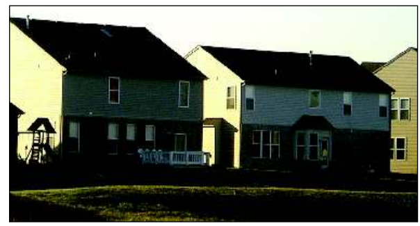
Right: Full masonry wrap and pop-out room