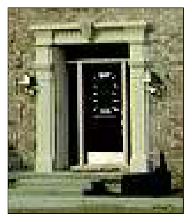
Above: Enhanced entry