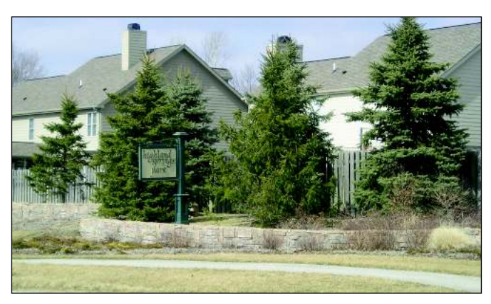
Above: A photo that illustrates the benefit of subdivision perimeter screening. In the absence of screening, architectural features on the rear can provide relief.

Rear facades that can be colorless and devoid of features and do not contribute to the streetscape.