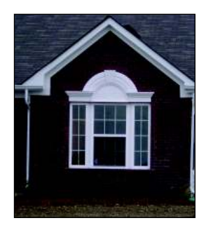
Above: Decorative Window Molding and Gable