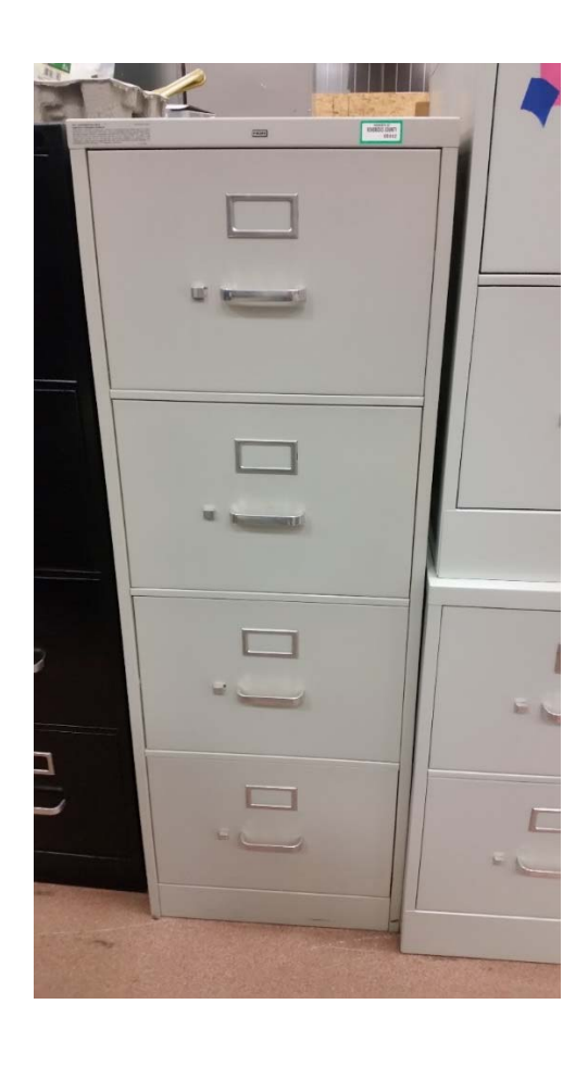
S_11.1 (only shows 1 of total being sold)