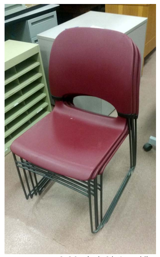
S_6.2 (only 2 being sold)