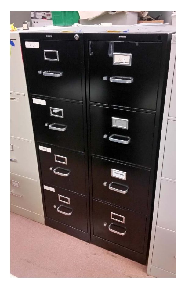
S_10.1 (only shows 2 of total being sold)