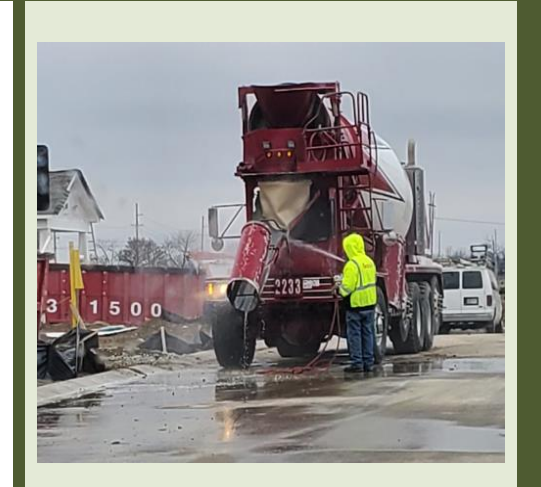
Avoid doing final rinse of trucks outside of the washout area.