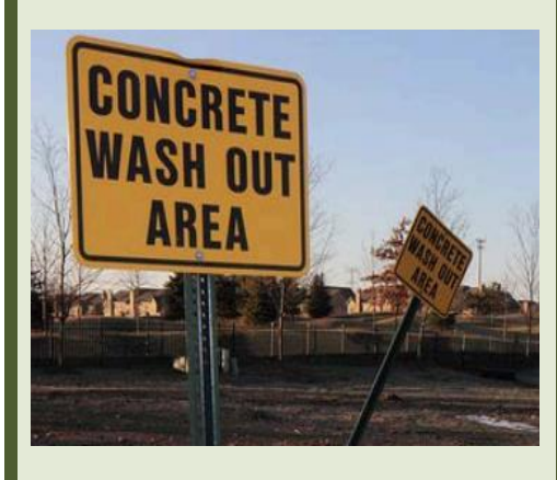
Properly identify concrete washout areas with visible signage.