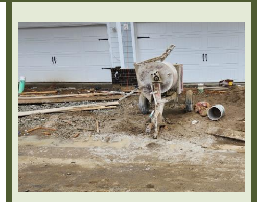
An improperly managed mortar mixing station can allow corrosive washwater to enter the stormwater system through curb inlets.