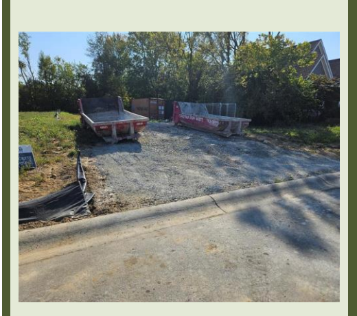
Washout area is accessible and placed on stone pad and away from storm inlets and water resources.