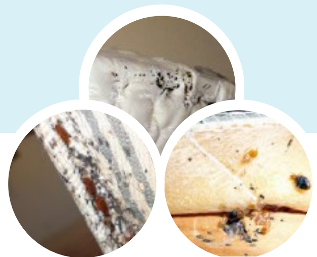
Bed Bug Infestations