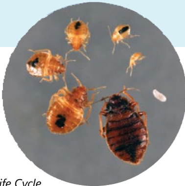
Bed Bug Life Cycle