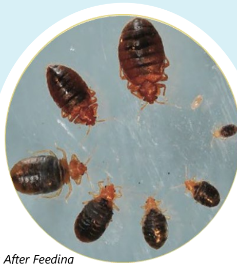
Bed Bugs After Feeding