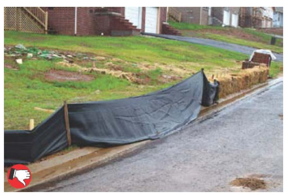
Improper trenching of silt fence.