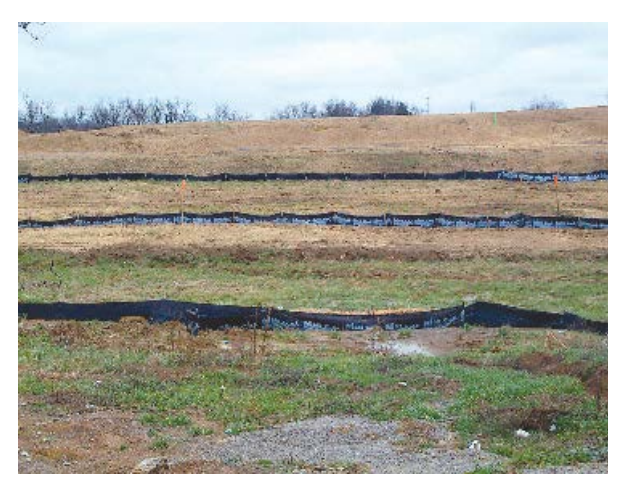
Use multiple sections of silt fence to interrupt long slopes.