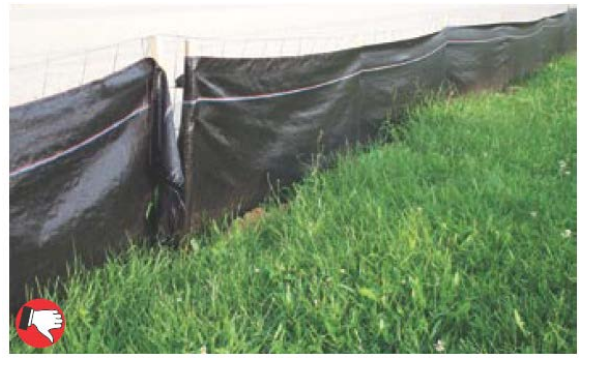
Two sections of silt fence not properly connected. Sections should be overlapped and wrapped together.