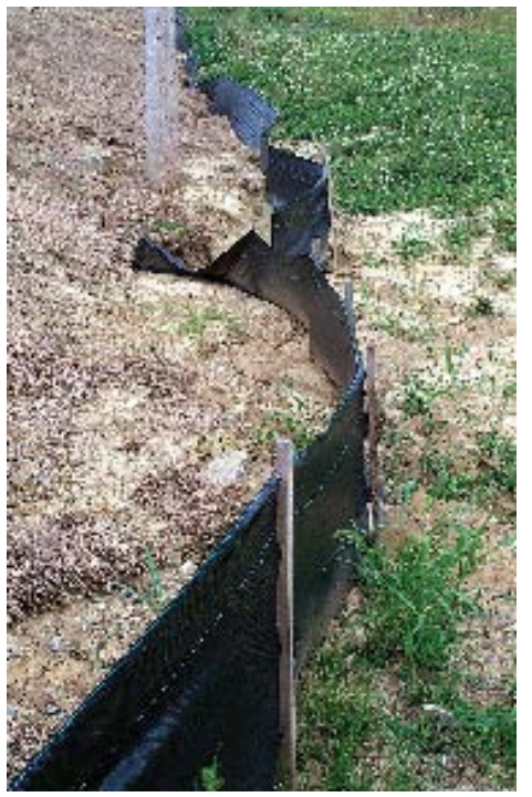
Silt fence functioning but in need of cleaning and replacement.