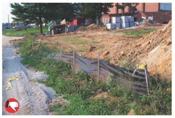
Inadequate maintenance of silt fence.