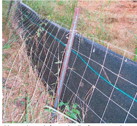
Use wire-reinforced silt fence and steel posts to reinforce sections downstream of large areas.