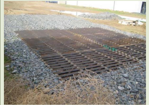
Rumble strips can be used in combination with a stone entrance.