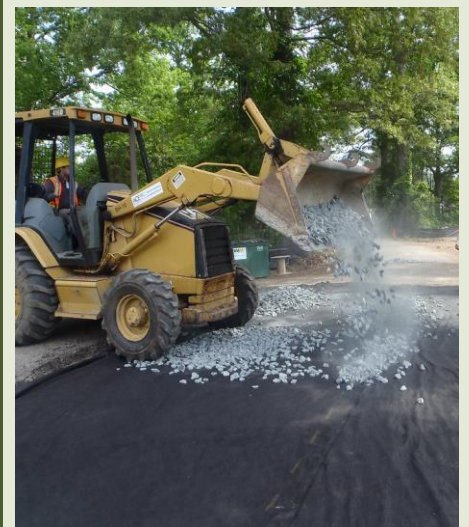
Geotextile fabric placed beneath the stone aggregate prevents the stones from sinking into the soil.