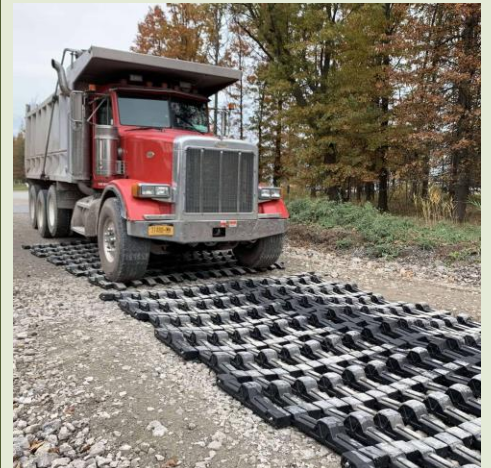
Manufactured construction entrances can be cleaned and reused for other projects or locations.