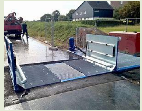
Wheel washing stations can be used to wash vehicles exiting the site.